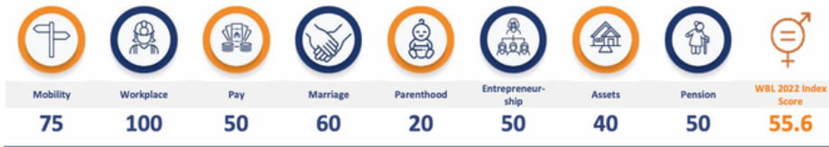
Pakistan - Scores for Women, Business and the Law 2022